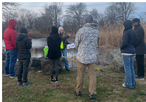
Volunteers gather to learn how to collect water samples for testing