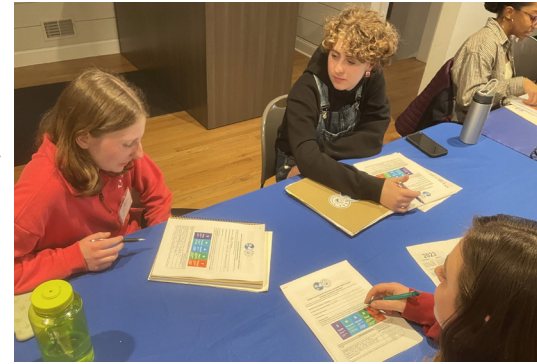
SEALs discuss plans and processes for their community-based projects

COA looks forward to sharing the enlightening and impressive projects of these young environmental advocates!