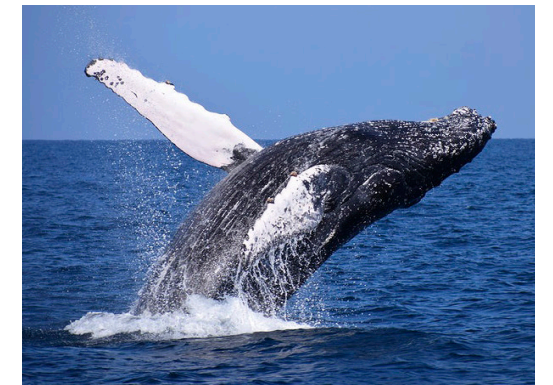
Humpback whale breaching

Take Action: (a) Attend/Speak at virtual (January 31 and February 13, 2024) and/or in-person (February 5, 7, and 8, 2024) public meetings, and (b) write/send comments to BOEM requesting a 90-day extension to the comment period and/or outlining concerns. Comment deadline: February 26, 2024.