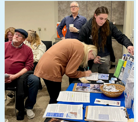
Attendees learn about COA campaigns

Seeking opportunities to get involved in south Jersey? Contact Toni Groet at Outreach@CleanOceanAction.org .