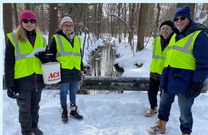
Road salt testing volunteers field training