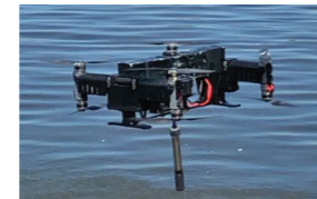
Investigating drone technology for water quality monitoring

Additionally, Rutgers University is collaborating with COA and the Borough of Red Bank to evaluate how drones can be used to monitor water quality (e.g. DO, salinity, temperature etc.) in the Navesink. The use of drones to conduct real time monitoring of water quality in rivers is innovative, and Rutgers University is in the initial stages of evaluating this technology in the brackish waters of the Navesink. We will share more updates in the future.