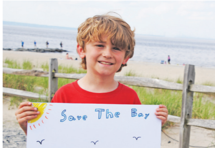
Tall and small must join together to stop the NESE pipeline

As you may recall on June 5, 2019, the New Jersey Department of Environmental Protection (DEP) denied crucial permits for the pipeline. However, the denial was made in a way that left the door open for the company to reapply. The company has already taken advantage of this and on June 10, 2019, William/Transco filed a reapplication for the necessary permits.