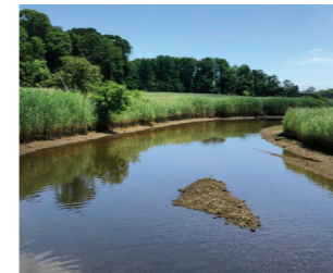
Year Three of COA-DEP ambient bacteria monitoring in twenty locations is in full swing