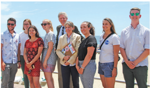
Chairman Pallone with COA Crew

Chairman Pallone and NJ Department of Environmental Protection Commissioner McCabe ban together to oppose offshore drilling.