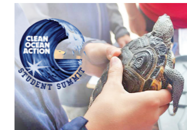
Terrapins at Southern NJ Student Summit

COA's Southern NJ Fall Student Summit will be held on Thursday, October 3, 2019, at 9am at Island Beach State Park in Seaside Park, NJ. Teachers may apply to participate in the free program, which is available to New Jersey middle school (grades 5-8) students from Ocean, Burlington, Camden, Gloucester, Salem, Cumberland, Cape May and Atlantic Counties.