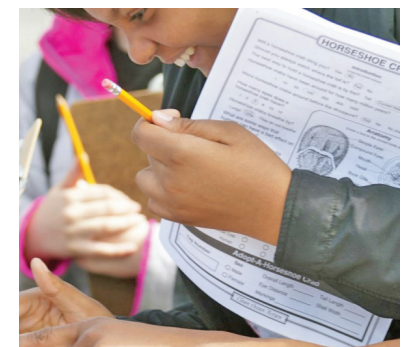
Marine Science—up close and hands-on!