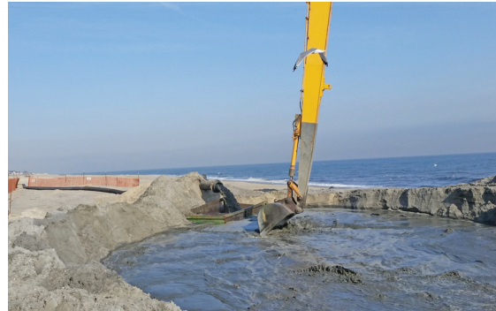
The dredged slurry of 90% sand is pumped through pipelines and is temporarily held in a sludge dewatering zone on the beach so that it can dry and be suitable for placement as beach fill.