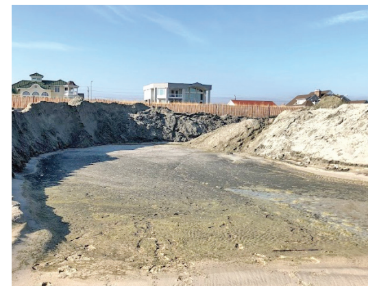
A trash trap in the dewatering zone helps to remove any debris that is transported with the dredged material from the river. According to NJDOT, daily maintenance activities include cleaning and flushing pipelines and removing and cleaning the trash trap every day.

Check out COA’s blog for COA’s full dredging report!