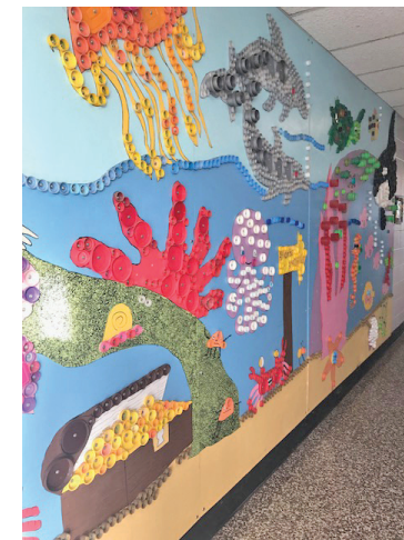
Carl Sandburg Middle School’s “Under the Sea” mural made with recycled bottle caps