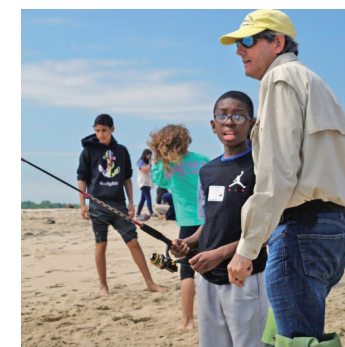
Exciting, sandy adventures!

The 30th Annual Spring Student Summit Application is available on our website. Middle School teachers from Central and North