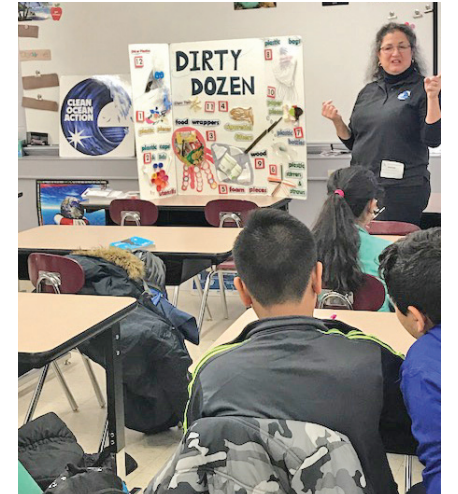
Middle School students from Carl Sandburg School in Old Bridge check their answers to the Dirty Dozen Quiz