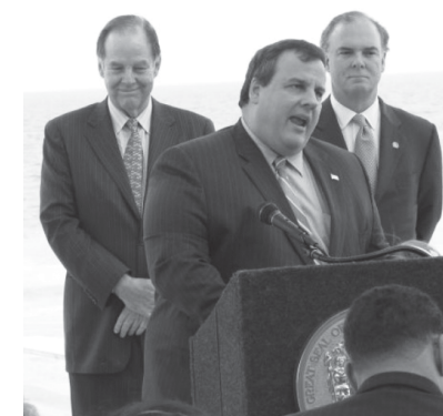
2009 Governor vows to veto any port off NJ

This fall is our last chance to fight the Port Ambrose LNG facility and pressure Governor Christie & Governor Cuomo to veto this