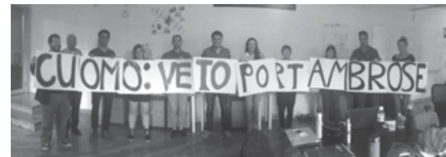
NY meeting on Port Ambrose

28 miles off New Jersey and 18 miles off Long Island. If approved, this project can be flipped into an export facility, which will result in an increased demand for fracking, destroy our land and waterways, and represent a security and public safety risk. We have fought this project before and won! We will need all hands on deck for this last battle to ensure we win again, especially for the future hearings in NY & NJ. For more information and to get more involved please email outreach@cleanoceanaction.org . More details to follow in the coming weeks.