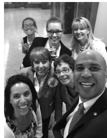
Selfie with US Senator Cory Booker

The Blue Vision Summit was a wonderful opportunity to meet and talk with different organizations and ocean minded people from around the country working to protect our marine environment.