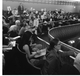
Activists at NYC Council Hearing