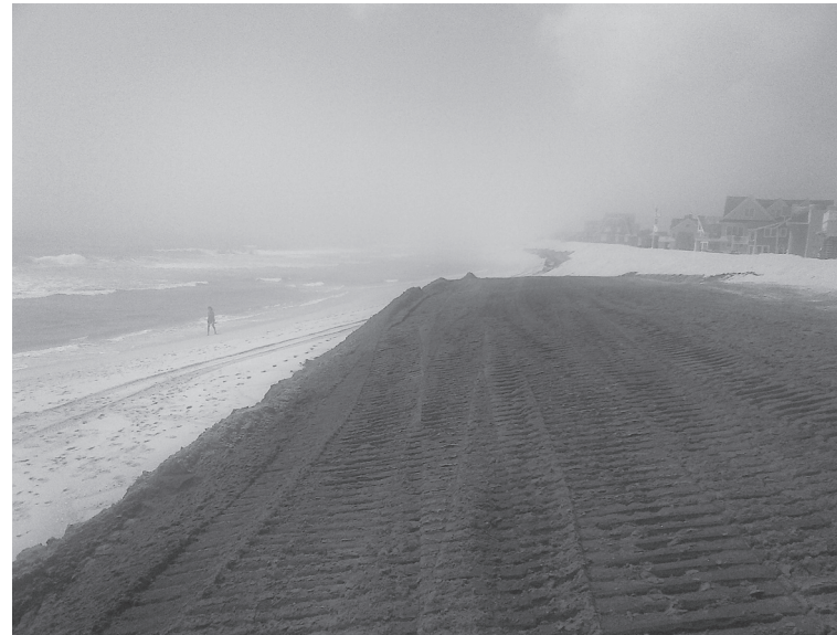
Dark sand spread from Deauville South to Normandy

In response to Superstorm Sandy, agencies in New Jersey are removing sediments deposited by Sandy from waterways where it poses a hazard to navigation. If sediments are tested to be 90% sand, they can be used for beach replenishment and other beneficial uses, such as marsh restoration. Citizens have contacted COA with their concerns about sand removed from parts of Barnegat Bay that has been placed on Brick Township beaches that is much darker than normal beach sand. COA has been investigating the issue and talking with government agencies and locally affected citizens to determine if the sand poses a potential health risk. The sand has been sifted to remove debris. Some limited testing for chemical contaminants has shown that toxins are not above standards. COA is pushing for additional tests including fecal indicator bacteria that could indicate potential sewage contamination.