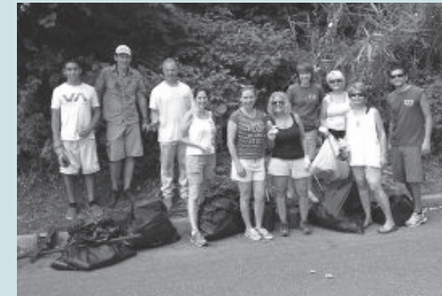
Volunteers in Highlands, NJ

On July 20th, Clean Ocean Action's Waves of Action For The Shore continued with dedicated volunteers working on five projects. Projects included beach, waterway, and a reggae concert with the band Reef'd in Avalon, NJ.