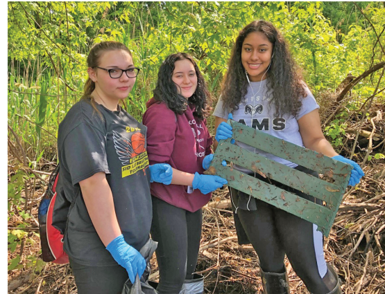
Hightstown HS students uncover a chair at the Lambertson Beach Sweep site on the Delaware River

the amount of debris, including single-use plastics decreased. However, more unattended debris was discovered at a new, third location.