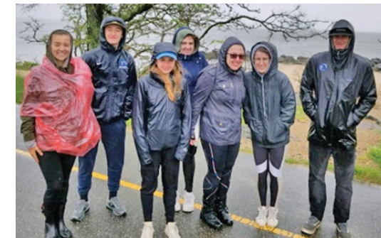
Wet and cold but still all smiles from some of our volunteers