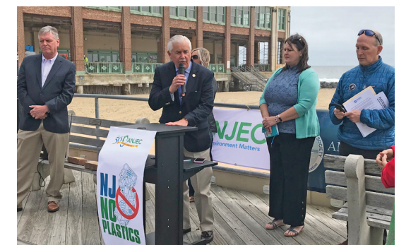
Assemblyman Eric Houghtaling speaking at the press conference in Asbury Park

On Tuesday, May 7 environmentalists, elected officials, and citizens gathered to celebrate the 50+ New Jersey towns that have passed ordinances to ban certain single-use plastic items such as straws, bags, polystyrene and balloons. While the benefits are many, the wasteful use of plastics, particularly for single-use items, has become a plague and is an ecosystem crisis. These products never completely go away – they can last for generations long after their single use. These 50+ towns have taken the first strides in the fight against plastic pollution. COA urges more municipalities to take action to reduce plastics and litter for a better future for our wildlife, communities and waterways.